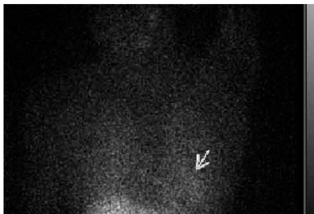
Figure 1. ^{123}\text{I} -MIBG scintigraphy at diagnosis (arrow: cardiac region).

Overtraining syndrome is defined as a state of prolonged fatigue and physical underperformance due to intense training with inadequate rest periods. 1 This leads to the autonomous nervous system failing to adapt giving rise to