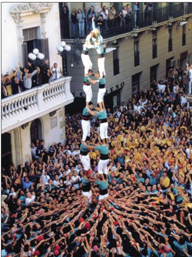
Fig. 3. «»Torre de vart, a human tower built by the Castellers of Vilafranca. Traditional Catalan «castellers» are an apt symbol for the teamwork and dedication that bring together, for a common purpose, large groups of people of different ages and backgrounds.

journals, and first among the subgroup of cardiovascular medical journals published in Spanish. In 2000 the IF rose to 0.7, 4 and in 2002 (the last year for which data are available) our IF was calculated as 0.94 (Figure 2), a figure that places the journal squarely within the mainstream of all journals ranked according to IF.