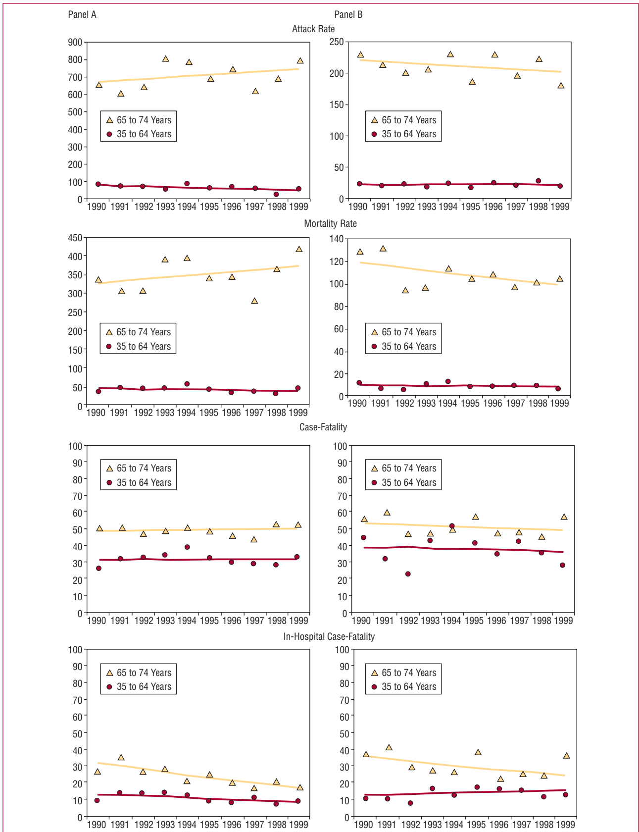
Figure 1. Evolution of attack and mortality rates per 100 000 population, and total and in-hospital case-fatality rates due to myocardial infarction for two age groups in males (A) and females (B) with their linear trends. Definite infarction, fatal or non-fatal, possible fatal or those with insufficient data are included. Period 1990-1999.