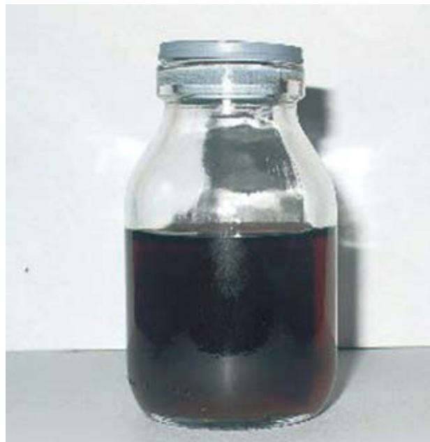
Figure 2. Patient's urine changed colour after 24 hours of exposure to the environment.

The association between alkaptonuria and aortic valve disease has been postulated and it has also been reported that this valve is the most affected by this condition, followed by the mitral and the pulmonary valves. Aortic stenosis is the most commonly associated disease, although it has also been linked to aortic and mitral regurgitation. 4 Furthermore, cases like ours have been published linking alkaptonuria with coronary artery disease. 5