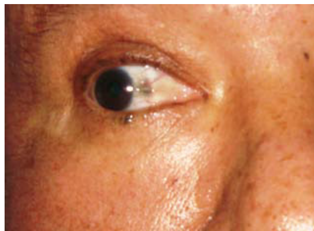
Figure 1. Internal black discoloration of the aorta and scleral pigmentation of the right eye.