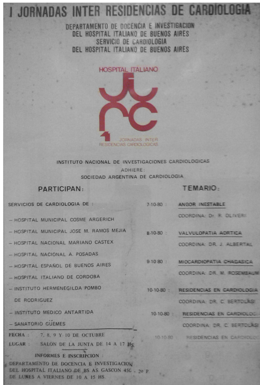
Figure 1. Poster from the first Inter Residents Cardiology Conference, in 1980.

born the first Inter Residents Cardiology Conference in Argentina (figure 1), the impact of which surpassed the expectations of its organizers. The following year, this conference was repeated with greater participation from both attendees and training centers. It then became necessary to organize a coordinated effort to plan future activities. In 1982, a resident was elected president of this new institution, which in April 1983 obtained legal status. Thence was born the Argentinian Council of Cardiology Residents (CONAREC, by its initials in Spanish), a scientific society formed exclusively by residents, with positions elected annually by peers, and whose membership spans residents' training period. So, when