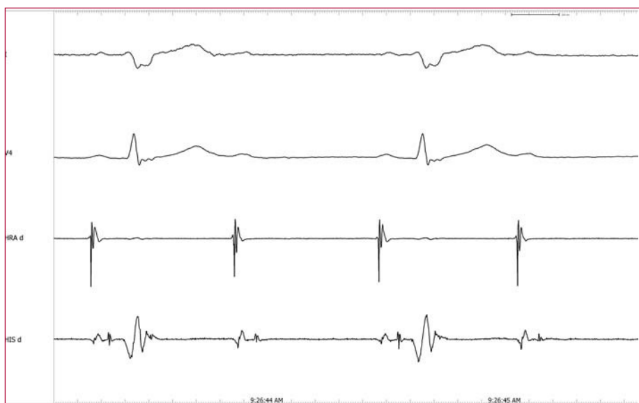
Figure 2. Recording of the electrophysiologic study showing infra-Hisian 2:1 atrioventricular block.

of the conduction disorder as compared with an electrocardiogram done 6 years previously (Figure 1). The Holter showed a Mobitz II second degree AVB during the moments of maximum heart rate and a 2:1 AVB during an episode of clinical palpitations. The electrophysiologic study showed severe involvement of the infra-Hisian conduction (HA, 67 ms; HV, 68 ms), with frequent P waves spontaneously blocked at the infra-Hisian level