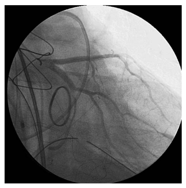
Fig. 1. Right anterior oblique caudal projection showing a subtotal occlusion of the coronary circumflex artery after the emergence of the obtuse marginal branch, located approximately 3 mm from the Carpentier ring.