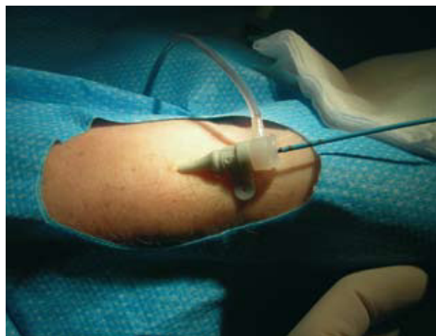
Figure 1. Radial introducer and Medtronic Mariner® 5 F ablation catheter.