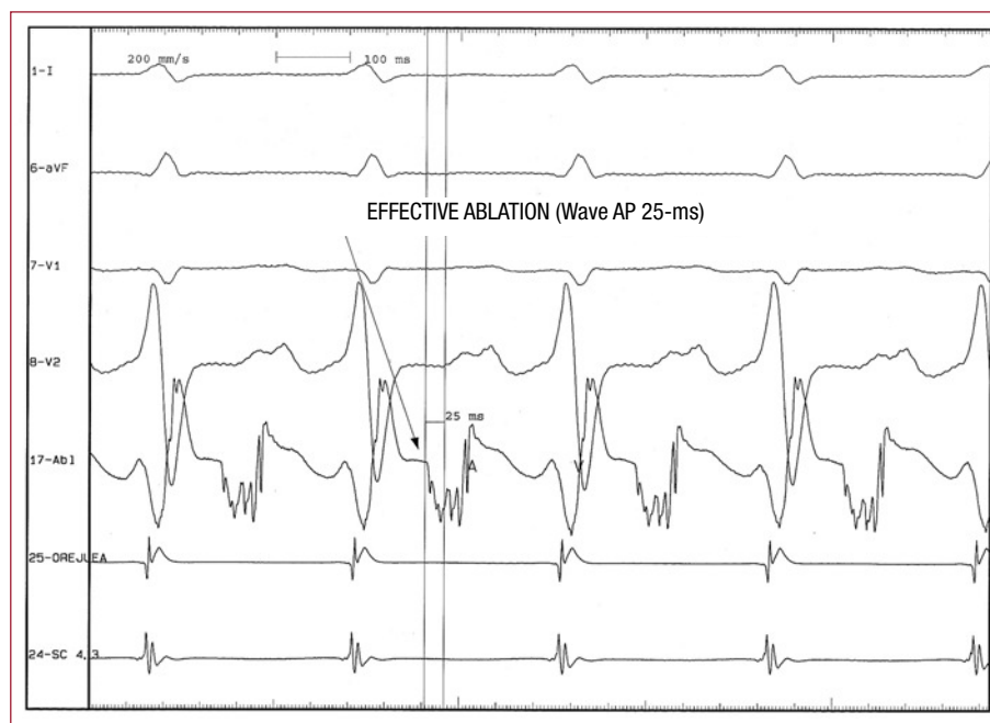
Figure 1. Intracavitary recording of the ablation catheter, auricle of right atrium and distal coronary sinus. Radiofrequency ablation site, showing a premature 25-ms AP.

The electrocardiogram showed atrial tachycardia with (+) P waves in leads II, III, and aVF, (–) in aVL and (+/–) in lead I. The transthoracic echocardiogram showed a highly dilated left ventricle with a 25% ejection fraction. Electrophysiological study was conducted, which confirmed automatic tachycardia in left atrium at 224 beats/min (atrio-atrial interval, 268 ms).