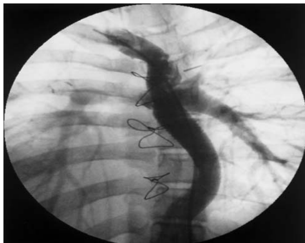
Fig. 1. Angiographic image obtained by injecting contrast material into the superior vena cava. Filling of the entire tube graft shows inverted flow from the superior vena cava toward the inferior vena cava.