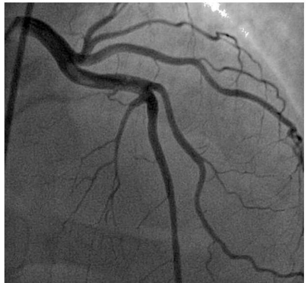
Figure 1. Coronary angiography. Anteroposterior cranial view: thrombus in proximal segment of the left anterior descending artery.

and coagulation parameters were all normal. Given the lack of cardiovascular risk factors and the presence of arterial thrombosis, a hypercoagulation study was performed 48 h after admission to hospital. Fibrinogen, protein S, protein C, and antithrombin III levels were normal. Neither mutation of Leiden factor V nor lupus anticoagulant was detected. FVIII levels were elevated (234.2%; normal range, 50%-140%). The patient did not have a history of