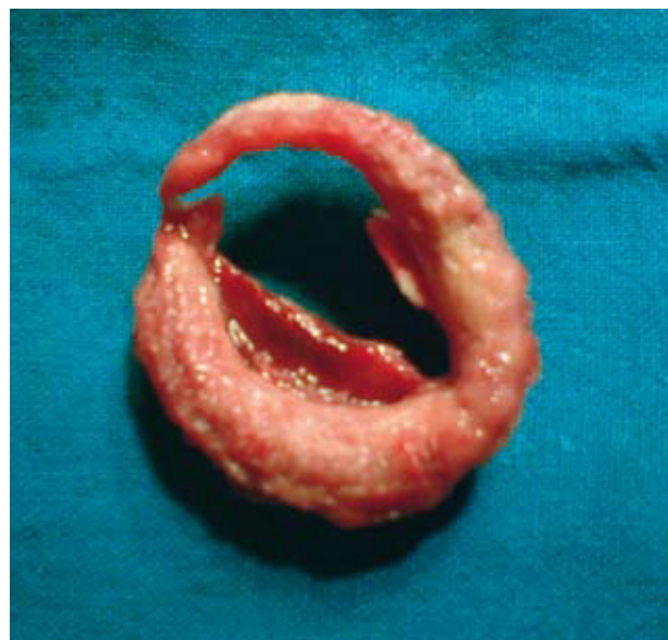
Figure 2. Organised thrombus reproducing the shape of the prosthetic ring.

Fibrinolysis has been described as the treatment of choice for tricuspid prosthetic valve thrombosis with success rates of up to 80%. Although there are several norms with different fibrinolytic agents and varied doses, the efficacy of rt-PA has been demonstrated. It carries the advantage of having