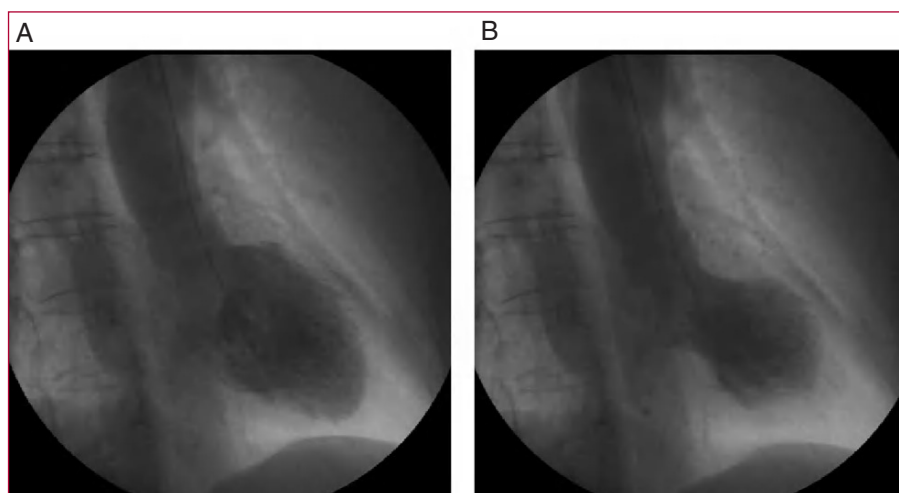
Figure 2. Ventriculography at third day of hospitalization. A: end-diastole. B: end-systole; an apical aneurysm is evident, with normal contractility of the basal segments.

with 2 extrastimuli was induced, and on the basis of these findings, an automatic defibrillator was implanted. At the time of discharge, she presented mild apical hypokinesia with left ventricular ejection fraction of 55% and electrocardiographic persistence of negative T-wave, which had normalized in the 4-month follow-up.