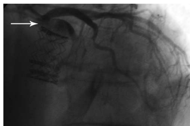
Figure 2. Paravalvular recess formed between the implanted aortic valve, the left aortic leaflet and the left sinus of Valsalva, with a radiotranslucent image in its interior and blood stasis.