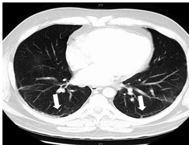
Figure 2. Subpleural bands of parenchyma in both lower lobes, some with cavities < 1 cm.

a heart-lung pump, the aortic valve was replaced by a mechanical St. Jude 23 mm prosthesis. It was found that the aortic valve had vegetation, a fistula and a mycotic aneurysm in the proximal part of the ostium of the RCA with the origin of the RCA within. Therefore, a pericardial patch was placed to occlude the aneurysm and a bypass of the RCA artery was performed with saphenous vein. No aortic periannular abscess was found. The immediate postoperative was favourable, and the patient is currently asymptomatic from the cardiovascular point of view.