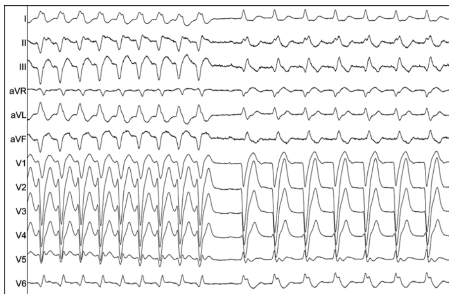
Figure 2. Suppression of ventricular tachycardia in an elderly patient with ischemic heart disease by radiofrequency application.

Data were analyzed with the SPSS program (version 15.0 for Windows).