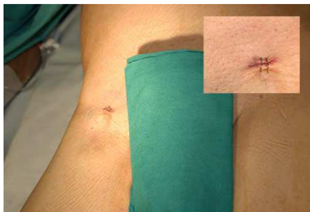
Figure 3. Final result in one of the patients included in the study. The upper right box provides a close-up of view of the access site after closure.

Studies evaluating complete percutaneous access in endograft implants are limited. Most of them use a single vascular closure device and have been conducted mainly in patients with abdominal aorta disease. Our results in the thoracic aorta are comparable to reported previously reported valves, with success rates ranging from 70% to 95%, according to the type of patient selected. 6,7 Haas et al carried out 13 procedures in 12 patients, with 100% success using devices that required arterial dilations of up to 16 Fr. 7 In 1 case, they performed dilation of the access site to 22 Fr, followed by successful closure using the same technique as ours with 2 Prostar devices (10 and 8 Fr). Torsello et al conducted a randomized study comparing surgery-based vascular access (n=15) to percutaneous access (n=15) with vascular closure using a single 10 Fr