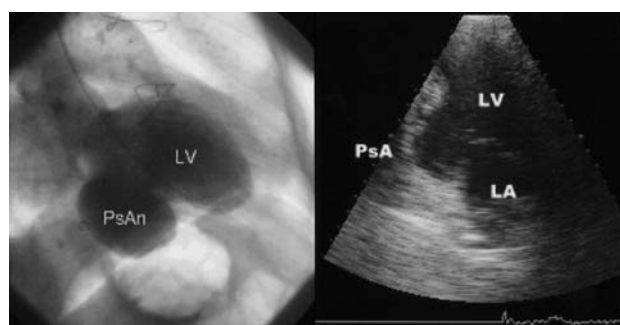
Fig. 2. Left: Ventriculography during the second AMI in which a large posterobasal pseudoaneurysm (second rupture) is visible. Right: Transthoracic echocardiogram showing the left ventricle with a pseudoaneurysm comprising the inferoposterobasal and medial segments, with slow flow inside. LA indicates left atrium; LV, left ventricle; PsA, pseudoaneurysm.

ries. After cardiogenic shock, CRFW is the second most frequent cause of hospital death due to AMI. It is debated whether thrombolysis increases its relative incidence 2 , although administration of this treatment in the first 6 h reduces the absolute number of cardiac ruptures as a consequence of the overall decrease in mortality. Forty per cent of CRFW occur in the first 24 h of AMI and 85% in the first week. CRFW is thought to be associated more often with advanced age, female sex, arterial hypertension, primary transmural AMI without previous angina or collateral circulation, and relatively small and uncomplicated infarcts. 3 The diagnosis of CRFW is suggested by its clinical presentation, that is, the appearance of sudden electromechanical dissociation (without previous heart failure), and is confirmed by echocardiographic evidence of a large pericardial effusion with echoes suggestive of the pre-