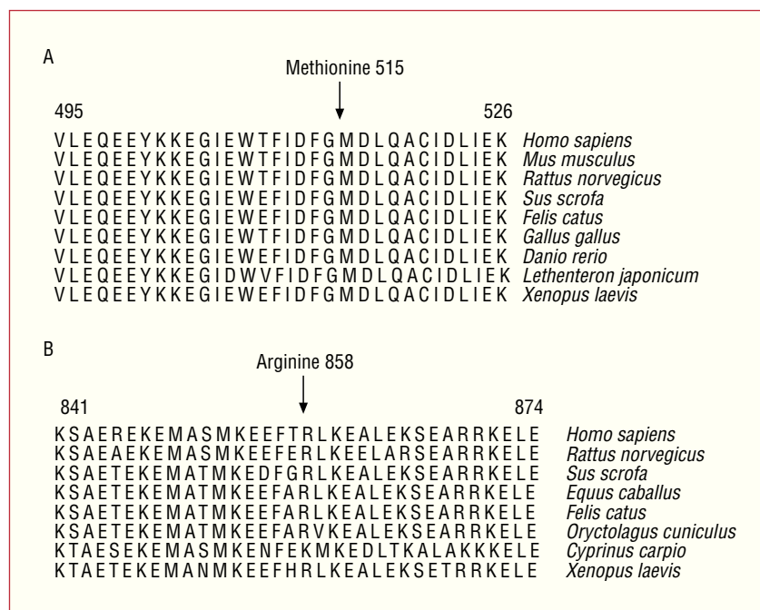
Figure 2. Aminoacid sequence of the heavy chain of human cardiac beta-myosin, showing the conservation of methionine 515 (A) and arginine 858 (B).

other mutation detected was Met515Val. The strict conservation of methionine 515 (Figure 2A) indicates that this mutation may affect the function of the protein.