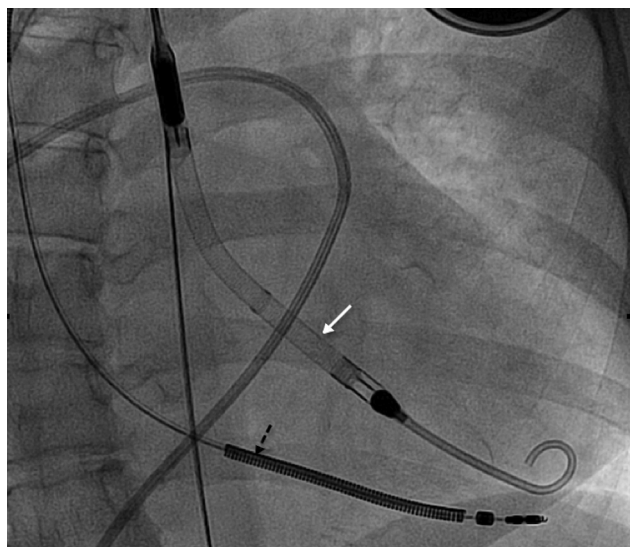
Figure. Fluoroscopy during the implantation of the Impella CP ® (white arrow) showing the lead of the implantable cardioverter defibrillator (black arrow).

device, the patient showed left homonymous hemianopia due to right occipital hemorrhage requiring urgent surgical drainage. It was decided to stop anticoagulation therapy and, thus, the VAD was removed while high-dose vasoactive support was maintained. After 2 weeks of proper neurological development and no hemorrhage and due to progressive hemodynamic deterioration, an intra-aortic balloon pump was implanted, without anticoagulation, and the patient was included on the emergency heart transplant list. The transplant was successfully performed 48 hours later. Ten months after the heart transplant, the patient has minimal neurological sequelae that do not impede a normal life.