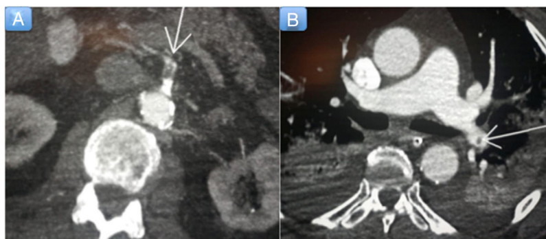
Figure 2. A: computed tomography (CT) scan of the abdomen showing a filling defect in the superior mesenteric artery consistent with arterial thrombosis (arrow). B: CT scan of the chest showing findings consistent with pulmonary thromboembolism (arrow).

COVID-19 mainly causes complications such as pneumonia and acute respiratory distress syndrome. Cardiovascular complications have been reported in several cases and are a marker of poor prognosis. 1 Acute cardiac injury, defined as a significant elevation of cardiac troponins, is the most widely reported cardiac abnormality in COVID-19. 1 Numerous cases of concomitant heart failure have also been described. Acute coronary events appear to be relatively uncommon, perhaps because of the high levels of systemic inflammation and prothrombotic effects caused by SARS-CoV-2. There have also been reports of ventricular dysfunction and acute myocarditis. 1