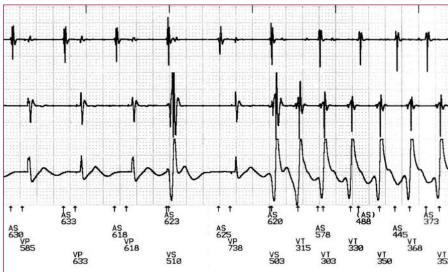
Figure 2. Electrograms recorded by a cardioverter defibrillator during sustained monomorphic ventricular tachycardia. The tracing shows a ventricular tachycardia onset preceded by a short-long-short sequence.

with CCM. It is generally accepted that SMVT in patients with CCM is due to reentry. 6 This model is based on an appropriately timed trigger (PVC) that interacts with a substrate, generating a conduction delay and a circular movement around a fixed obstacle. Patients with CCM have the anatomic substrate for the development of reentrant SMVT. 6 We also know that PVCs are frequent findings in patients with CCM and that a number of such patients have multiform PVCs and R on T phenomenon. 4 Although there are no data about the mode of SMVT initiation in patients with CCM, R on T phenomenon might be suspected to be the trigger of SMVT. However, short-coupled PVCs were seen exceptionally in the present study. This was also the case in some previous reports in patients with ICDs without CCM, which demonstrated that the onset of SMVT is generally preceded by a late-coupled interval. 8,10-12 In this regards, Roelke et al 10 reported that among 22 postinfarction patients, the onset of SMVT was preceded by a late-coupled PVC in 86% of the episodes. Other authors revealed that the onset of SMVT was characterized by the presence of a mean PR >0.70 (range, 0.70-0.80) in a general population with ICD. 8,11,12