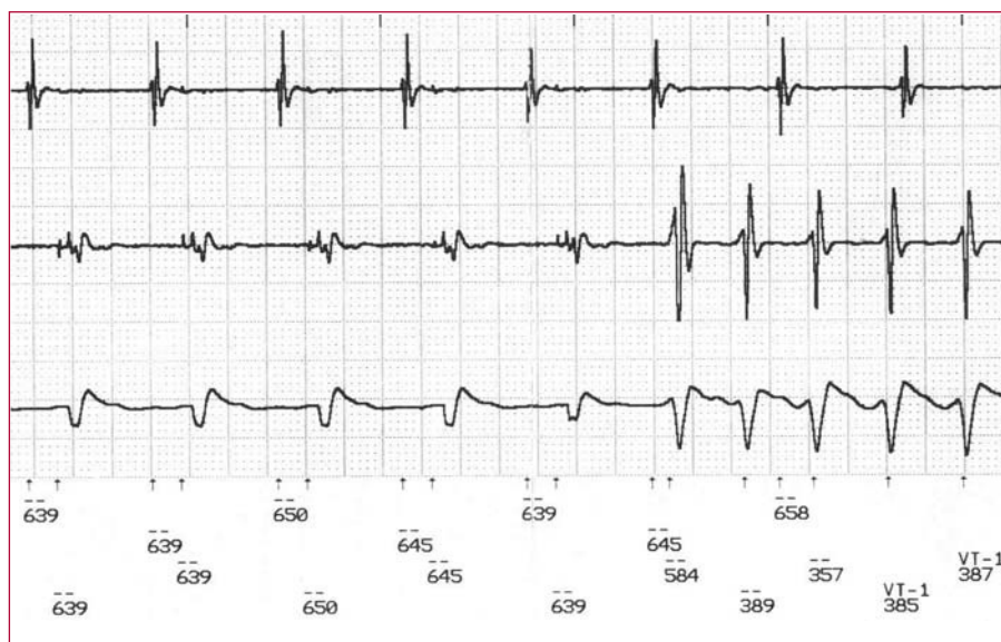
Figure 3. Electrograms recorded by a cardioverter defibrillator during sustained monomorphic ventricular tachycardia. The tracing shows a sudden onset with a typically long-coupled interval.

than the ensuing SMVT could be due to focal activity originated in a different site and entering the circuit to start reentry or, similar to the sudden onset initiation, be the result of a previous sinus beat which, after traversing the slow conduction zone, exits the circuit at a different site than the first beat of SMVT. In addition, differences in the modes of initiation of SMVT compared with other substrates could be related to an epicardial origin, which is common in Chagas cardiomyopathy. 13