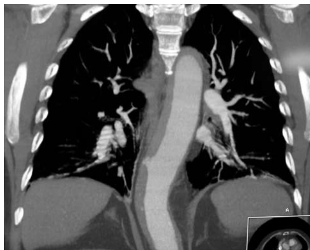
Figure 1. Computerised tomography angiography at time of admission. The 3D reconstruction shows the image of infiltrated internal layers of the descending thoracic aorta, at D9 level, together with an intramural haematoma that affects nearly the entire descending aorta.

Penetrating aortic ulcers typically occur in the thoracic aorta, and primarily in elderly patients. They occur fundamentally in aortas that are significantly