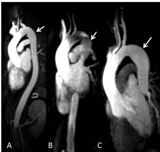
Figure 2. Three-dimensional reconstruction of magnetic resonance angiography images of patients III:4 (A), III:6 (B) and III:8 (C) in Figure 1, showing peculiar mild narrowing at the level of the isthmus and post-isthmus aortic ectasia (arrows).

Abbreviations: ADil, aortic dilatation; ADis, aortic dissection; Asp/H, arm-span-to-height ratio; F, female; FacF, facial features; JointH, joint hypermobility; M, male; MVP, mitral valve prolapse; na, not available; PAcet, protusio acetabulae; PCar, pectus carinatum; PExc, pectus excavatum; PPlan, pes planus; Scol, scoliosis; Surg, surgery; W&T, wrist and thumb signs; –, not present; +, present.