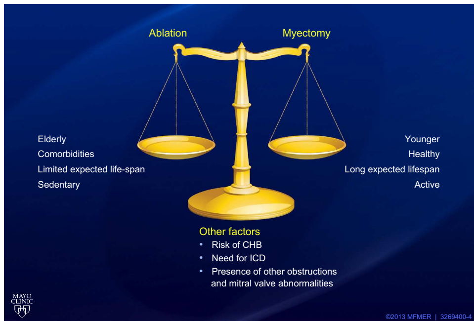
Figure 2. Septal reduction therapy: factors influencing the therapeutic decision. CHB, complete heart block; ICD, implantable cardioverter-defibrillator.

Foundation/American Heart Association guidelines gave surgical myectomy a IIA recommendation and stated that this “is the first consideration for the majority of eligible patients with HOCM”. 6