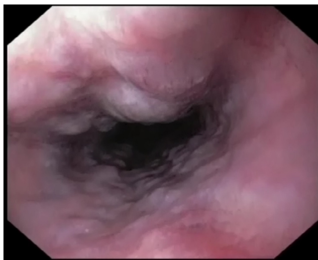
Figure 1. Grade III esophageal varices visualized by endoscopic ultrasound.

Endoscopic ultrasound is a diagnostic and therapeutic method used in digestive procedures, such as cholangiopancreatography, gastrointestinal tumor staging, and the treatment of pancreatic cystic lesions, subepithelial lesions, and gastric varices. It has a distal ultrasound transducer that runs at frequencies of 5 to 20 MHz, with penetration-depth and resolution variables that allow highly precise real-time imaging of the digestive tract wall, surrounding organs, and blood vessels. The endoscopic ultrasound probe is equipped with color Doppler ultrasound, pulsed Doppler, and elastography (software used to assess fibrotic tissues), but has the drawback that it is a monoplanar device. In patients at high risk of esophageal bleeding, in whom TEE is contraindicated, endoscopic ultrasound may be a safer option for LAA closure procedural guidance because any of the rare complications that may occur are immediately identified during the procedure. 6 Clinical trials support its use in gastrointestinal hemorrhage situations in patients with esophageal varices, although the use of the technique has not been previously described for the specific evaluation of cardiac structures or as a technique to guide interventional cardiovascular procedures.