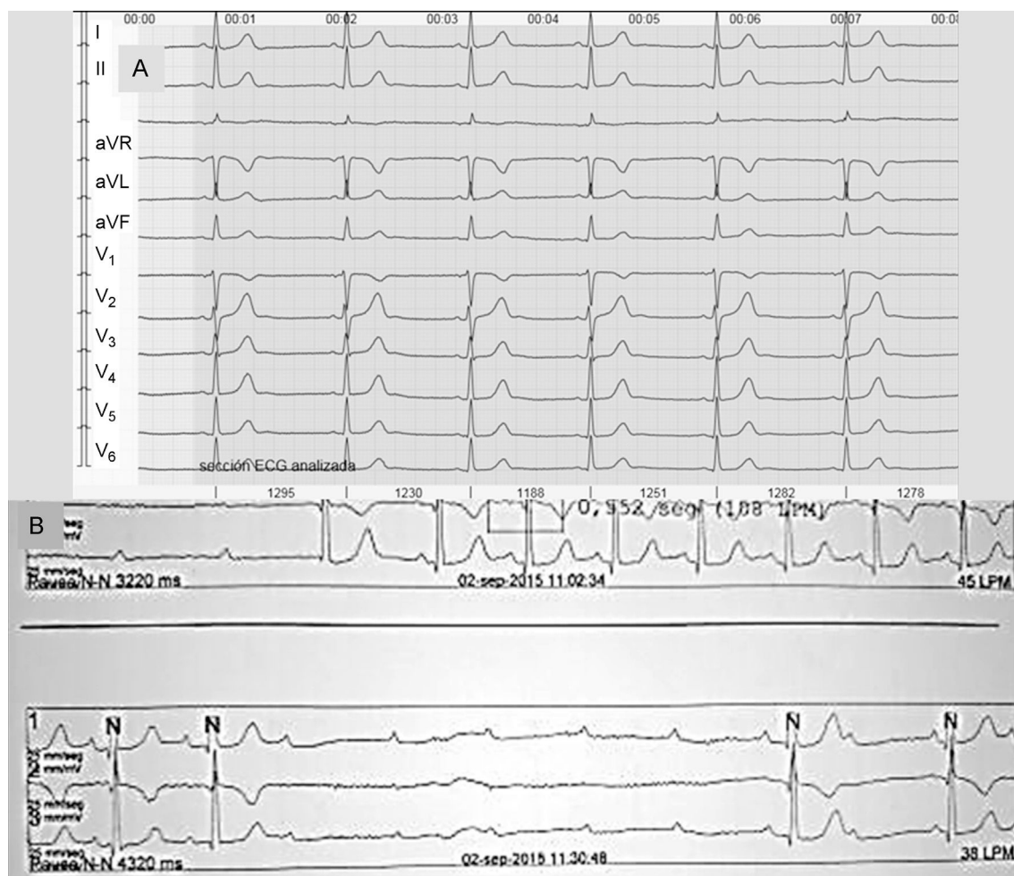
Figure 1. A: Baseline electrocardiogram, sinus bradycardia at 48 beats per minute, normal axis, PR normal, narrow QRS with no repolarization abnormality. B: External monitoring, third-degree atrioventricular block with delay of 4320 ms and QRS escape of similar morphology to the baseline electrocardiogram.

cigarettes a day. The patient had no family history of congenital heart disease or ischemic heart disease. She was not taking medications. She attended our center with cardiogenic syncope and associated head trauma, resulting in minor frontal subarachnoid hemorrhage and no progression in the follow-up computed tomography. She was admitted to the cardiology department for study of the syncope. On questioning, the patient reported syncopal episodes from the age of 12 years, all with very similar characteristics, as well as other presyncopal episodes lasting 8 to 10 seconds that resolved spontaneously. The examination revealed no remarkable findings. No murmurs or indications of heart failure