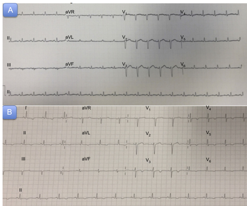
Figure 1. A: Admission electrocardiogram. B: Electrogram 72 hours after acute symptom onset.

The patient's clinical course while in the emergency department was poor, with onset of respiratory failure and lactic acidosis (lactic acid, 4.2 mmol/L) associated with abdominal pain. Suspected sepsis was investigated with a chest and abdomen computed tomography scan, which revealed signs of congestive heart failure and a small pericardial effusion (maximum diameter, 12 mm) (Figure 2B). Transthoracic echocardiography identified moderate left ventricular dysfunction (ejection fraction 37% by the Simpson method) and a