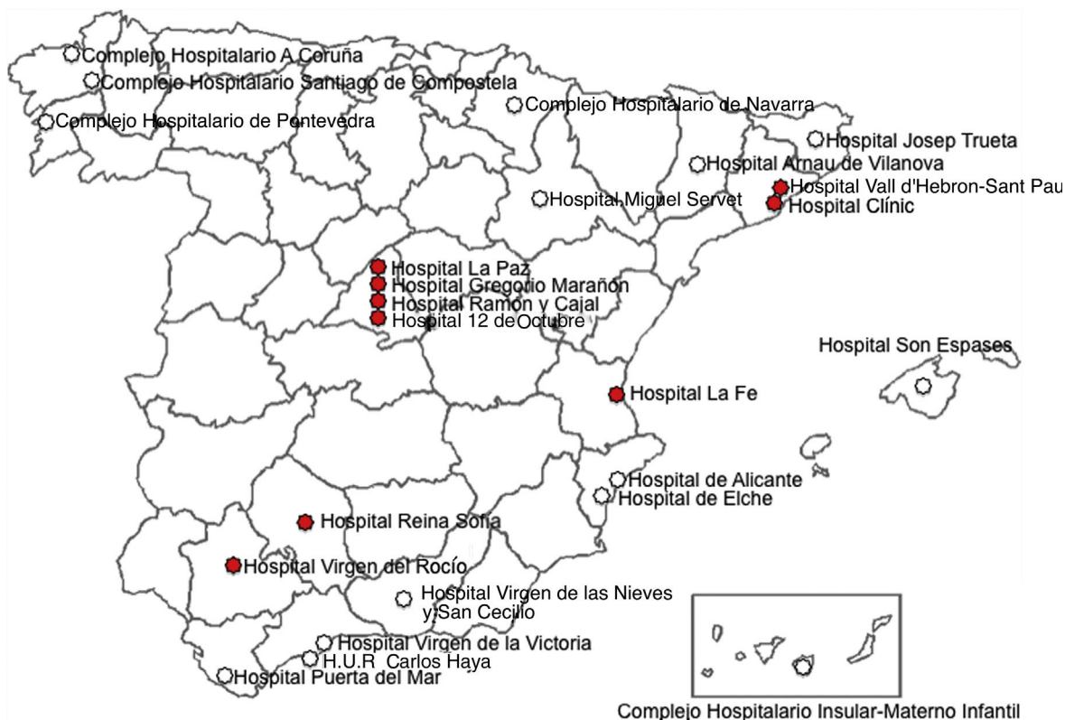
Figure 1. Distribution of centers with specific activity in adult congenital heart disease in Spain. Filled circles indicate the national Centers, Services, and Referral Units (CSURs).

excluded from the analysis and 24 centers participated in the survey. There were 6 centers in Andalusia, 4 in Catalonia, 4 in the Community of Madrid, 3 in Galicia, 3 in the Valencian Community, 1 in the Chartered Community of Navarre, 1 in Aragon, 1 in the Balearic Islands, and 1 in the Canary Islands. There were no centers in the other autonomous communities (figure 1). Of the 24 centers, 9 have been recognized as Centers, Services and Referral Units (CSURs) by the Spanish National Health System. Figure 2 shows the year in which ACHD health care was initiated in the 24 centers. In 2005, only 5 centers met the requirements for specific care. After this year, there was a steady increase in their number.